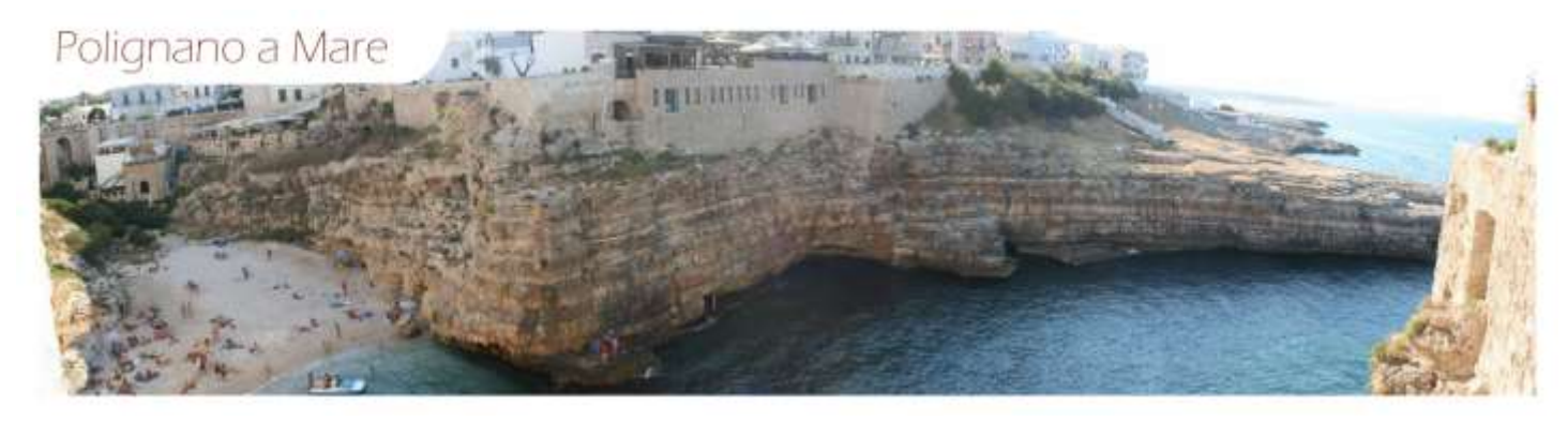
Breakfast at the Masseria and then meet your private driver for transfer to the city of Monopoli and the sensational city