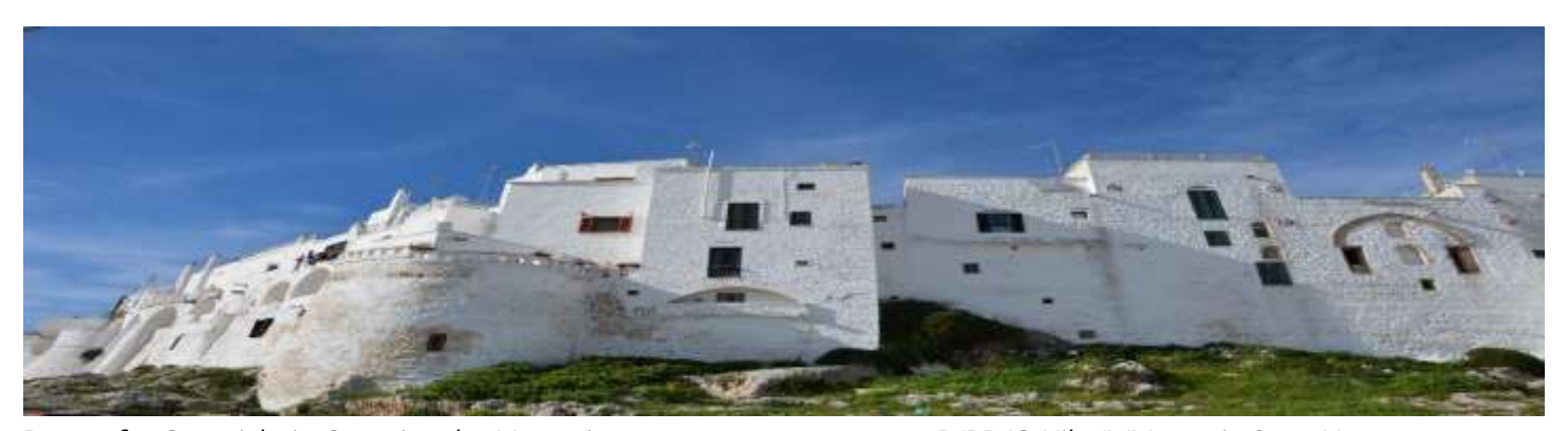
Return for Overnight in Ostuni at the Masseria.

This morning after breakfast you will meet your driver to arrive to the Torre Guaceto Nature Reserve (25 min) for an invigorating hike near the Adriatic Coast. Return to the Masseria for lunch, yoga and free time and then early evening meet with your driver again for an independent visit of the city of Ostuni (12 min).